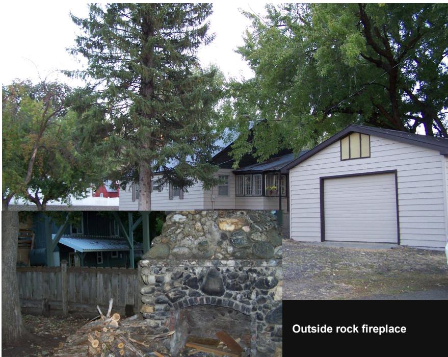
Outside rock fireplace